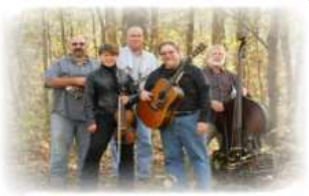
FOGGY HOLLOW Jan 16 th 2016

Good Food! No Alcoholic Beverages No Smoking