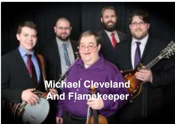
Michael Cleveland And Flamekeeper