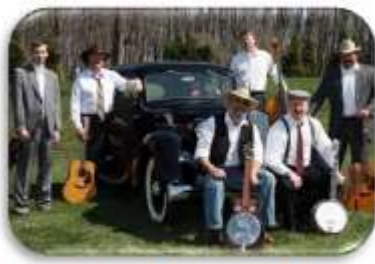
SALEM BOTTOM BOYS Mar 19 th 2016

Benefits: Union Volunteer Fire Company 61 Main Street Felton, PA 17322 717-246-3892 feltonfireco.org