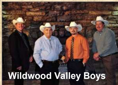
Wildwood Valley Boys