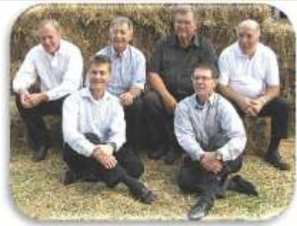
BLUESTONE Feb 20 th 2016