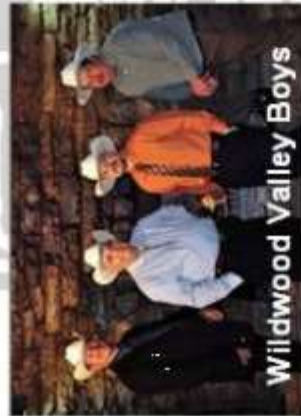
Wildwood Valley Boys