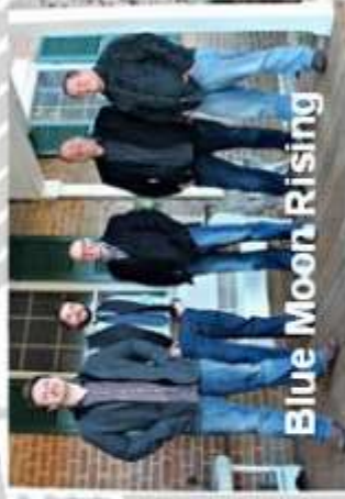
Blue Moon Rising