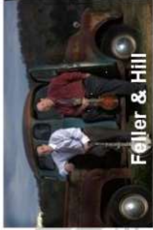
Feller & Hill

FMI Contact: (717) 395-7128 - (717) 350-4791